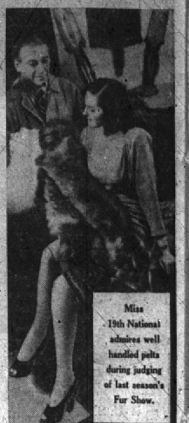
Miss 19th National award well handled pelts during judging of last season's Fur Show. them to Sears, Roebuck and Co., Raw Fur Marketing Service at the warehouses of these points: Chicago, Philadelphia, Memphis, Dallas, Kansas City or Seattle. Thousands of trappers have earned Sears Fur Show awards. YOU CAN, too!

When you ship your furs to Sears you can depend upon receiving top prices. Every award is an addition to cash Sears pays you for your pelts on top. Even if you don't earn an award, careful handling enhances the value of your furs. So, you can see that careful pelt handling does pay. You Get These 5 Advantages: 1. Top market prices for your pelts. 2. Individual grading—each pelt you ship is graded separately on its own merits. 3. Localized grading—your furs are graded by men who are experts in your section. 4. Prompt cash returns—sent within 24 hours after your furs reach us. 5. Extra money opportunities in Fur Show awards! Remember, only handling of pelts counts, not kind or value of fur. When your furs are ready, ship