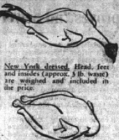
New York dressed, head, feet and insides (approx. 3 lb. waste) are weighed and included in the price.

Kroger Oven-Ready Turkeys are completely cleaned, fully dressed, ready to roast. Giblets are cleaned, placed in carcass. Enjoy the tenderest, juiciest, easiest-to-fix turkey you ever had... a better value. (An 11-lb. Kroger Oven-Ready Turkey is equivalent to a 14-lb. New York Dressed Turkey.)