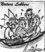
Nature Lubbers DON'T OVERLOAD THE BOAT IF YOU WANT TO KEEP AFOUNT MICHIGAN DEPARTMENT OF CONSERVATION

Never leave a fire unattended; the wind may increase in velocity, and an unguarded spark may start a fire or woods fire causing untold damage.