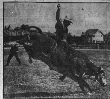
It's the thrill of conquest and the love of money that makes a cowboy take a beating like this one is taking from a wild steer at the rodeo in Calgary, Canada. In this case, cowboys were competing for more than $50,000 in prize money in the various events at the 63rd Annual Calgary Stampede, "World Series" of Canadian rodeos.