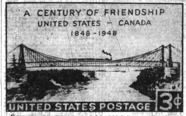
Commemorating "a century of friendship" between Canada and the United States, this new three-cent stamp will go on sale at Niagara Falls, N. Y., Aug. 2. Air-mail size, the stamp features the old Niagara Railway Suspension Bridge.