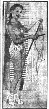
Take an old plastic shower curtain, trim it in a couple of places, drape it here and there, and what's ya got? Why, a bathing suit, of course—and nifty, too. Joy Lansing, movie actress, shows the finished item to good advantage.