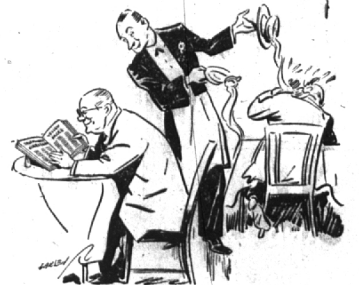
"Those telephone directory Yellow Pages are simply sailing over with useful information."