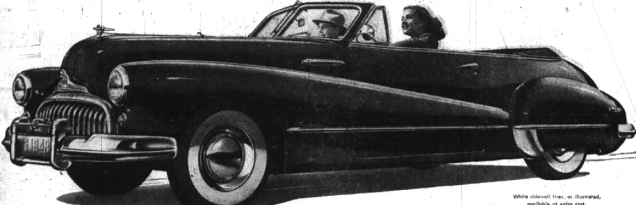
White sidewall tires, as illustrated, available at extra cost.