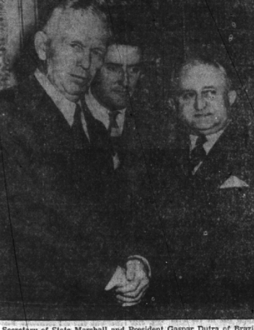
Secretary of State Marshall and President Gaspar Dutra of Brazil are shown at a reception given in Rio de Janeiro by Dutra as host for the Inter-American Defense Conference, meeting at F-1 tropia.