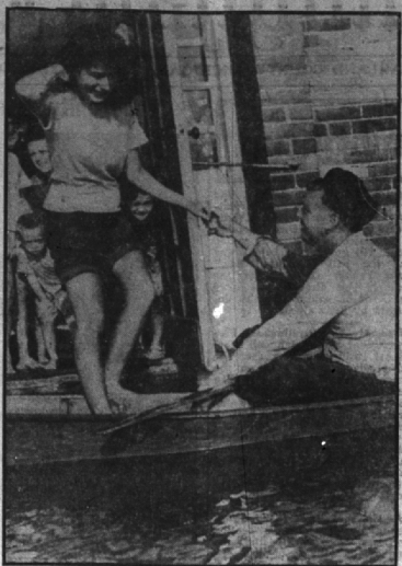
This lad found a pirogue—traditional Louisiana bayou transportation—handy for calling on his girl in flooded eastern New Orleans after the recent hurricane.