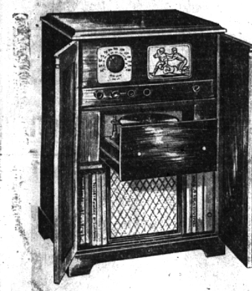
General Electric Model 202 Television Receiver... also works G-E FM-AM Radio Phonograph.