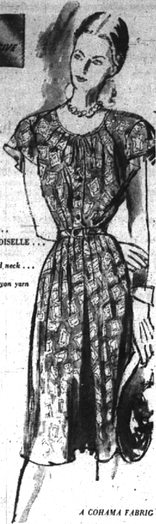
THE PORTRAIT PRINT... AS SEEN IN MADMOISELLE...

with its detectable low-arc neck... flight-of-lonely sleeves... A Keyhole of Bemberg rayon yarn in green, red or black on pastel grounds. 12 to 20.