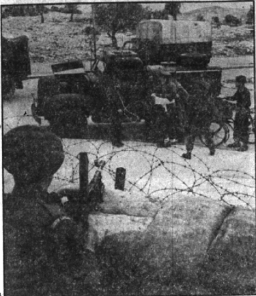
From behind a sandbag barricade a British gunner watches Tommie check papers of a tank truck crew before permitting the vehicle to enter a guarded zone of Jerusalem, scene of many Jewish underground outbreaks. Note the raised hood on the truck, where explosives might be concealed. Laid with bicycle at right is a new building, part of this sum will be used to purchase and equip a summer camp.