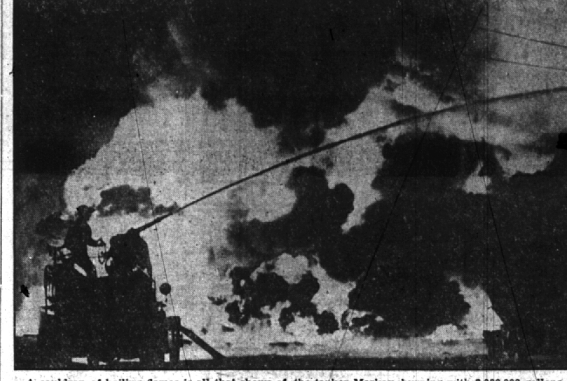
A cauldron of boiling flames is all that shows of the tanker Markov, burning with 3,000,000 gallons of gasoline at Wilmington, Calif. The background of fire silhouettes the fire truck at left.