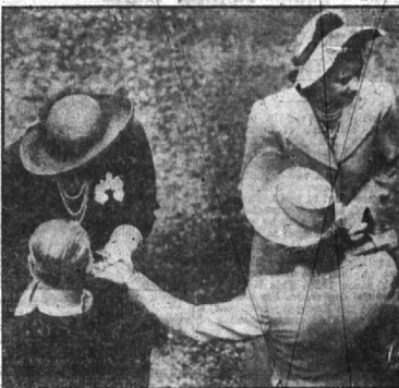
An eager guest inspects Princess Elizabeth's new engagement ring during a Royal Garden party at Buckingham Palace. The betrothal ring consists of one large diamond and two small diamonds in a platinum setting. At right rear is Princess Margaret Rose.