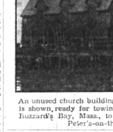
An unused church building, formerly Christ Church at Hull, Mass., is shown ready for towing on a barge to the Cape Cod Canal at Buzzard's Bay, Mass., to become property of the P.A.U.C. of Pelee's-on-the-Canal Episcopal Church.