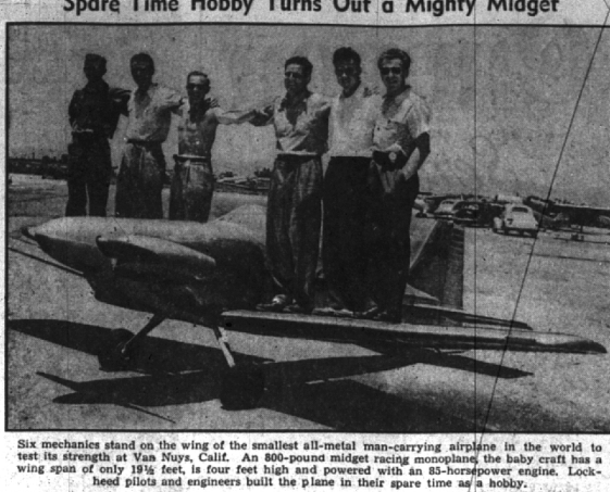
Six mechanics stand on the wing of the smallest all-metal man-carrying airplane in the world to test its strength at Van Nuys, Calif. An 800-pound midget racing monoplane, the baby craft has a wing span of only 18 1/2 feet, is four feet high and powered with an 85-horsepower engine. Lock-head pilots and engineers built the plane in their spare time as a hobby.