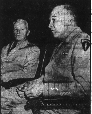
This serious study of Gen. Dwight D. Eisenhower, right, Army chief of staff, and Adm. Chester W. Nimitz, Navy chief of operations, was made as they both urged the Senate Armed Services Committee to make the WAC and WAVES permanent units of the armed forces.