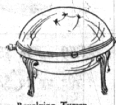
Revolving Tureen 100.00

Revolving tureen, excellent for vegetables, meat, with removable tray—out for soup. Beautiful piercing in this adorable six slot toast rack, circa 1880.