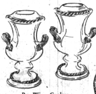
Pr. Wine Coolers $20.00