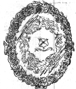
William Bateman Salver - 650.00