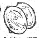
Pr. Salvers - 120.00