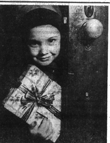
A small boy, a warm smile, and a wilyly wrapped gift—together they make a fine snapshot for a photographic Christmas Card.