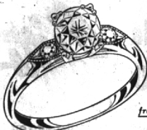
from $75 to $4,500

The beauty of a truly fine diamond is clearly visible in our DIAMONDSCOPE. You see for yourself the flawless quality, exquisite cutting, brilliance and clarity. Don't guess, be sure your diamond is well cut, free from flaws, and has good color. Buy from Gemicks' and see the diamond through this scientific instrument pictured above.