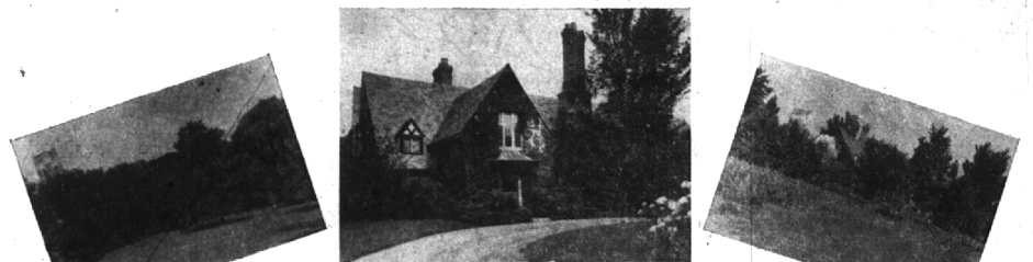
CRANBROOK ROAD ... IN BLOOMFIELD HILLS

Conveniently situated at the intersection of Lone Pine and Cranbrook Roads . . . Right in the heart of the Hills.