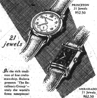
PRINCETON 21 Jewels $52.50