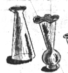
Ruby Glass Pieces

for these discriminating women on your gift list.