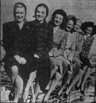
These six Goldwyn Girls, shown aboard the Queen Mary, are in England as models of American and British fashions. They're an exchange group—six British models are in the U. S.