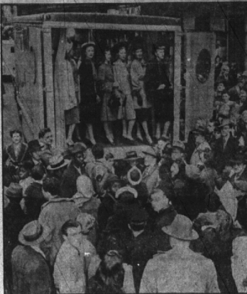
They're taking style shows to the people in Chicago's busy Loop these days. Here a crowd gathers around the mobile equipment at one of its 10-minute stops. Models can be seen at rear of mobile stage, waiting to pass by open side, where show goes on.