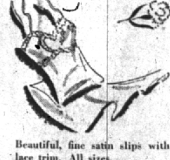
Beautiful, fine satin slippers with lace trim. All sizes.