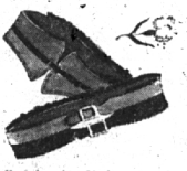
For the chic Mother—a wide handsome belt... very new.