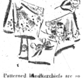
Patterned handkerchiefs are so beautiful for Mother.