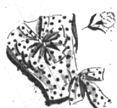
Polka Dot blouses go with Mother's suits and skirts.