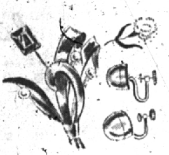
Costume jewelry in a wide and varied assortment.