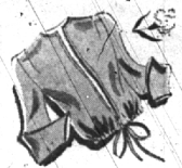
Drawing room blouse softly tailored to please the most discriminating.