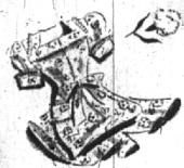
Charming cotton housedress trimmed in eyelid bordered organdy.