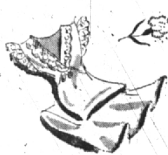
Dainty and oh! so pretty scalloped lace-trimmed nightgown.