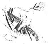
Smart, dashing chiffon scarfs that are so useful... so decorative.