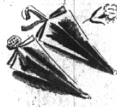
Umbrella for summer showers. In new plastics and rayons.