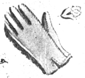
Fabric and kid gloves in assorted colors.