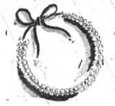
Wonderful double-strand choker of matched simulated pearls.