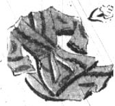
Soft, lightweight robes in summer pastels.