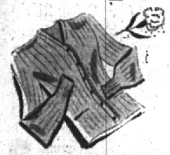
All wool coat and cardigan style sweaters in a choice of colors.