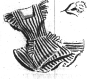
Summer pleat dress in striped chambray. All colors and sizes.