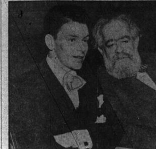
Frank "The Voice" Sinatra listens while sculptor Jo Davidson passes along a few thoughts at a session of the United Nations Security Council in New York.