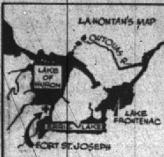
On Sept. 14 Baron La Montan landed at the fort, wintered there in 1687-8.