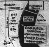
Built by Daniel Greysolon Dulhut in 1681, it quarded the Huron-Erie strait.