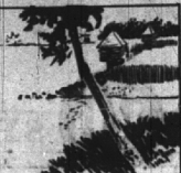
Fort St. Joseph at Niles was preceded by an earlier Fort St. Joseph, Port Huron.