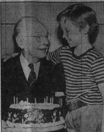
Harry Davenport, at 80 believed to be the oldest living American actor, holds his birthday cake while 8-year-old actor Butch Jenkins congratulates him. Davenport has been making movies since 1912, and when the picture was taken was working simultaneously on his 99th and 100th.