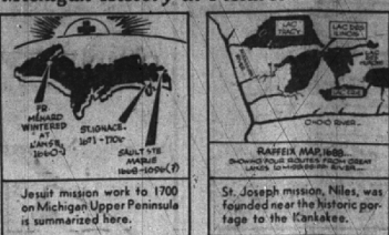
The strategic portage to the Straits of Mackinac was founded by the French in 1691.