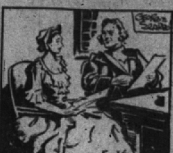
Their baptisms, marriages, deaths a treasured file of Michigan beginnings.

of the German Navy, the American members of the Naval and Merchant Marine commissions, and a Naval Technical Unit.