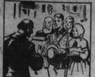
A news source: the bulletin published after mass. Few habitues could read.