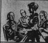
Frequent religious festivals fostered an unburned and a kindly disposition.