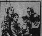
Age of humble faith—from cradle to grave their pastor was a certain guide.