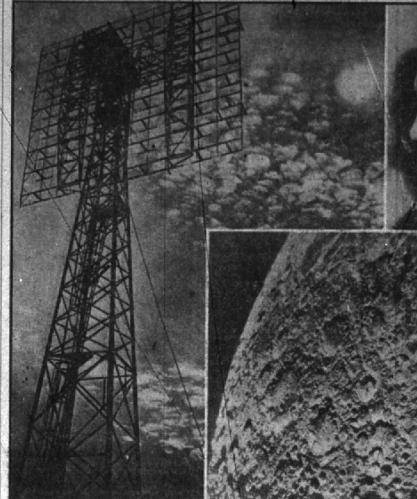
Standing gaunt against the moonlight during experiments in contacting the moon, the radar screen at Evans Signal Laboratory, Belmar, N. J., looks much closer than actual distance from the objective 238,000 miles away.