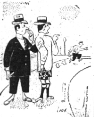
He's a smart thief—the must know clothes were cleaned by Beck Cleaners