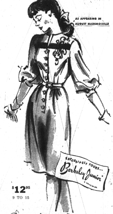
AS APPEARING IN AUGUST MADMOISELLE