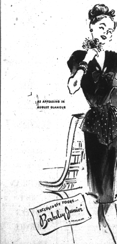
AS APPEARING IN AUGUST GLAMOUR

PEABODY BROTHERS FRUIT MARKET Hunter at Maple Phone 4039