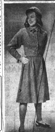
Grey and black striped men's wear suiting in a Junior suit with basque jacket.

THE BASQUE JACKET rates top honors in suits for Juniors this Fall, with the bolero competing. The new 1946-47 versions by New York designers make use of striped men's wear wools, pin-check, grey flannels and bright colors in tweeds and wool jerseys.