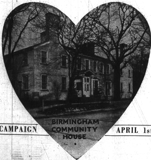
BIRMINGHAM COMMUNITY HOUSE

Right now mister—This is your cue Give lots of dollars. You can't overdo. Fill out that pledge card, your contributions renew For the beat of this great heart's depending on YOU. Mail in your pledge TODAY Keep the Heart of Birmingham alive!