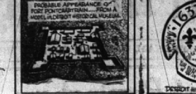
Cadillac hurried completion of the fort, fearing attack by hostile savages.