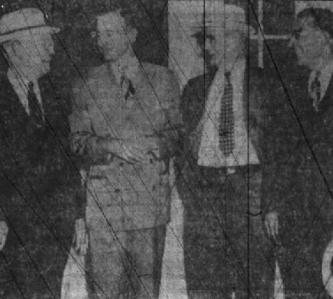
Four leaders who are participating in President Truman's plans for a labor-management "peace" conference this month: William Green, left; A. F. of L. president, Eric Johnson; U. S. Chamber of Commerce, president; Philip Murray; C. I. O. president; Ira Mather, National Association of Manufacturers president. They are shown at the White House.