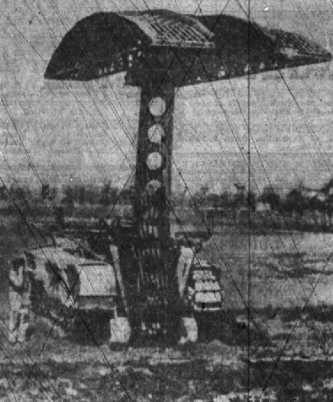
Secrecy is lifted from another strange weapon, the British scissors tank, which performed feats in the Normandy invasion unknown in previous warfare. The scissors tank carries its own bridge, a pair of ramps tank-truck being lowered over a gap in the trench. It raises and lowers the bridge hydraulically over ditches, craters, and the like. (British Official radiophoto.)