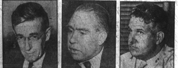
Three men who played major roles in developing the atomic bomb: Dr. Vannevar Bush, left, Director of the Office of Scientific Research; Dr. Niels Bohr, Danish physicist and Nobel Prize winner for atomic research; Mai-Guen...