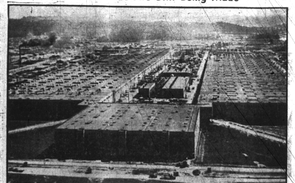
This is one of the tightly guarded factories at Oak Ridge, Tenn., where the atomic bomb was developed—and is still being made, President Truman said. This is one of the eight plants of the Clinton Engineer Works, a government reservation covering 59,800 acres.