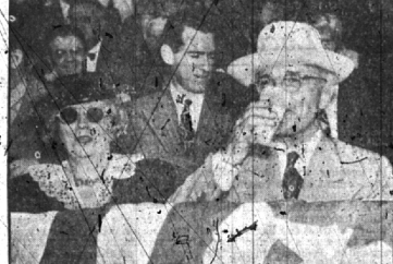
President and Mrs. Truman look like Mr. and Mrs. Average Fan as they watch the Washington Senators and St. Louis Browns battle at Washington.