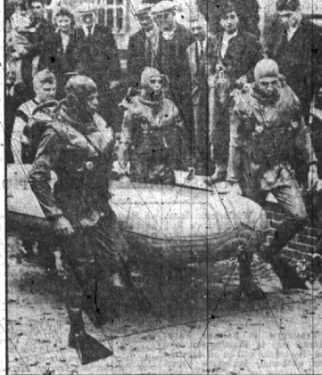
Hitherto secret D-Day fighters are these British "frog men," shown wearing webbed flippers and special diving suits as they carry a rubber boat. They are naval volunteers who destroyed underwater obstructions in the big invasion of France.