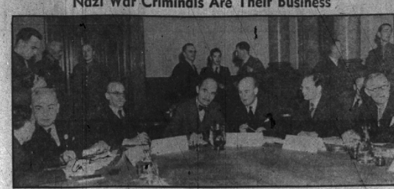
Members of the United Nations Tribunal to try major war criminals are shown during an informal meeting at Berlin. These representatives will sit in judgment over high Nazis at Nuremberg; Justice Robert Jackson, left, facing camera, U. S.; M. Donnedieu de Vabre, France; Francis Biddle, U. S.; Lord Justice Lawrence, Great Britain; Gen. I. S. Nikitchenko, Russia; Justice Sir Norman Birkett, Great Britain.