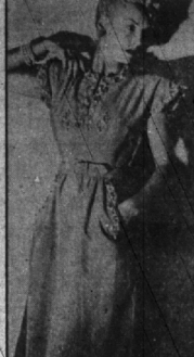
Neon pink tulle gown with embroidery and seed pearls in neck, sleeves, and pockets make this exotic afternoon dress.