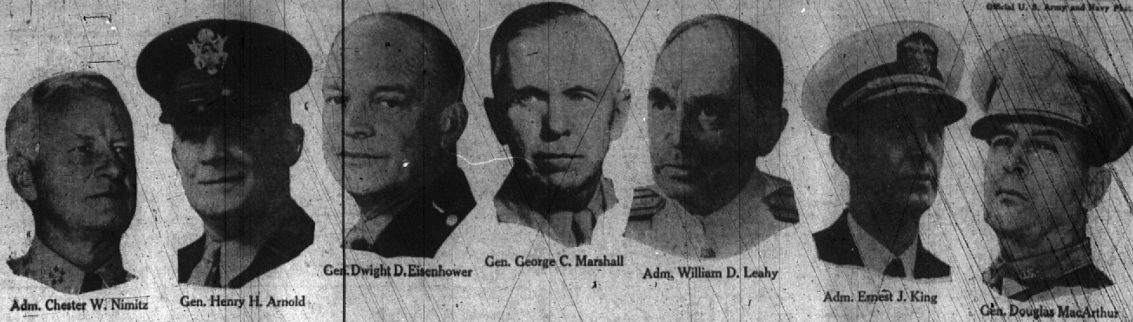
Adm. Chester W. Nimitz