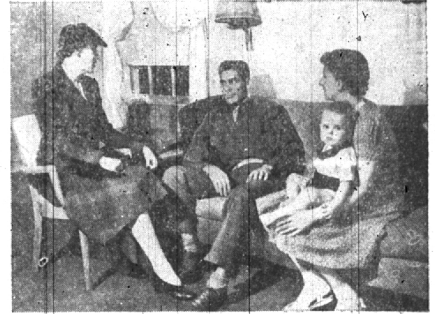
WELCOME BACK INTO CIVILIAN LIFE. The Red Cross provides special information and help for disabled veterans. The Red Cross answers questions about pensions, claims, vocational rehabilitation training. It is authorized to present veterans' claims. The Red Cross is at his side—always!