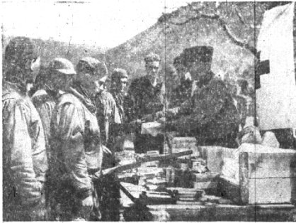
FIELD SERVICE AT THE FRONT! Wherever your soldier or sailor goes, the Red Cross goes, too! Field Directors distribute toilet articles, writing paper, cigarettes to men in the front lines. They maintain contact between these men and their families. In one month in 1944, Field Directors relayed more than 31,000 emergency messages.