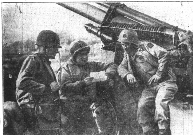
Thousands at the Front would be tormented by Home Worries. In this war millions of fighters bless the Red Cross Home Service for relief from anxiety about their loved one's welfare. Every week thousands of two-way messages are exchanged between Red Cross Field Directors with the troops and Home Service workers in American home towns—emergency questions about wives, children, sweethearts or parents. Your dollars will speed victory by bolstering fighting spirit.

The need is stupendous—no matter what turn the War may take. So the job the RED CROSS can do depends on your giving NOW—giving more than ever before.