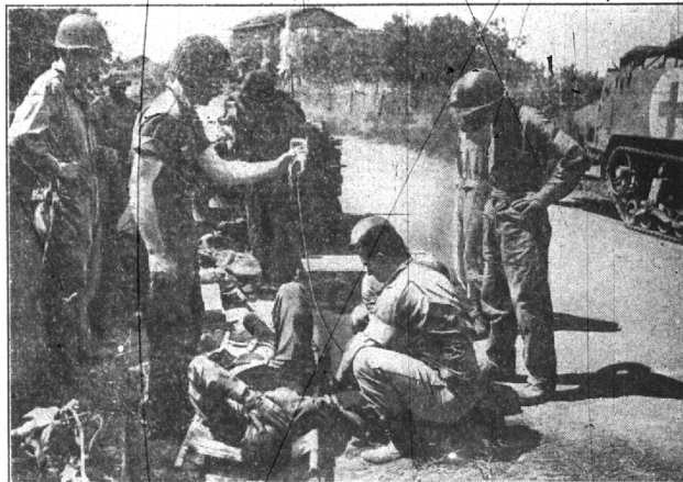
Thousands would die from loss of blood where they fell. This is the first war in which the folks at home actually saved lives at the front. Surgeons General of the Army and Navy say blood plasma has been the foremost lifesaver in this war. The Red Cross, through your blood donations and money, has collected and distributed millions of pints to the medical services.