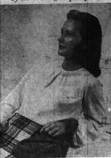
Smart high school girls "go in" for matching hats and bags. This head-bagging band (it's made on a bicycle clip) could hardly be called a hat, but the school crowd accepts it as one. The set is made from a tiny amount of red wool, dotted with tiny blue wool crosses. This is an excellent way to have smart accessories, to use remnants or scraps of fabric, and to save money for extra Victory Bonds.