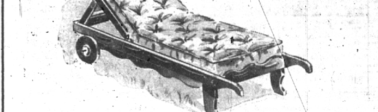
California Redwood Chaise Lounge

GENUINE CALIFORNIA REDWOOD - RUGGED AND BEAUTIFUL AS THE TALL TREES THEMSELVES!