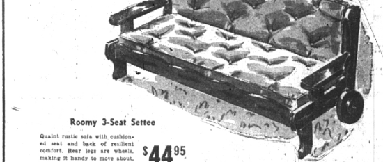
Roomy 3-Seat Settee

Quiet rustic style with cushioned seat and back of rich, weather-resistant material. Heavy legs are welded, making it handy to move about. Choice of colors.