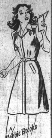
Bobbie Brooks ORIGINAL $10.95

A gay young dress for misses of career. It's a fly-front model in the easy-to-wear short sleeve, shirt-mimic style with softly gathered shoulders and darts at the waistline. Important dress in a girl's wardrobe! Lovely new pencil striped colors. Sizes 9 to 17.