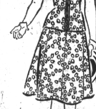
Bobbie Brooks ORIGINAL $7.95