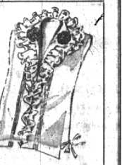
New Dickies $1.98 and $2.98 V-neck and jabot style, with fully or lay trims in spun rayon, sharkskin, marquisette or organza. All colors.