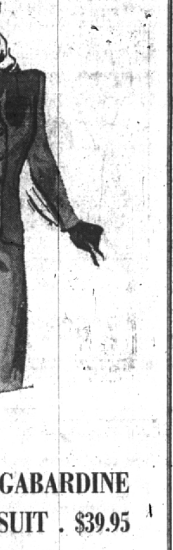
GABARDINE SUIT $39.95 from an interesting group of new arrivals

A gay young dress for misses of career. It's a fly-front model in the easy-to-wear short sleeve, shirt-mimic style with softly gathered shoulders and darts at the waistline. Important dress in a girl's wardrobe! Lovely new pencil striped colors. Sizes 9 to 17.