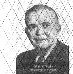
HARRY F. KELLY Gov. of Michigan

Through New Deal-controlled depression, for 10 years we have seen our liberties disappear. Year after year, millions have been forced to live on New Deal doles. Even Churchill, in 1937, accused the New Deal, through its persecution of capital, of forcing the world back into another depression! To restore our liberties, protect our freedom of speech, our vote and our opportunities to progress, vote for Dewey's program. To preserve good government in Michigan, re-elect Governor Harry F. Kelly!