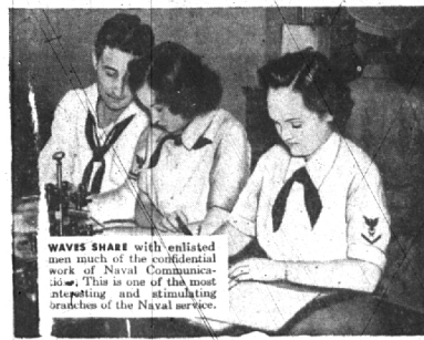
WAVES SHARE with enlisted men much of the confidential work of Naval Communications. This is one of the most interesting and stimulating branches of the Naval service.