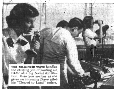
THIS AIR-MIND WAVE handles the exciting job of routing air traffic at a big Naval Air Station. Here you see her as she gives an incoming Navy pilot his "Cleared to Land" orders.