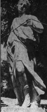
The U. S. having okayed salvage and protection of historic monuments in Sicily, this goddess at Agrigento obligingly holds a strand of field wire for American troops.

Not So Hard Native—George Washington threw a silver dollar across the Rappahannock while standing right on this spot. Tourist—I can easily believe that. They showed me where he pitched his camp across the Delaware where the British were at him and it was a lot wider than this.