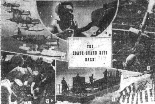
The Coast Guard is fighting on all the world's battlefronts. Hundreds more ships are now flying the Coast Guard flag. Thousands more men are needed to man these ships. (A) Coast Guard combat planes escort a convoy. (B) A Coast Guardman retires his teeth as he fires an anti-aircraft gun. (C) Coast Guard guns spit lead at the enemy. (D) More ammunition for Coast Guard guns. (E) A Coast Guard landing barge heads for the invasion shore.